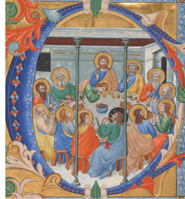
The Last Supper, from an illuminated manuscript, Florence, Italy, 1392-1399