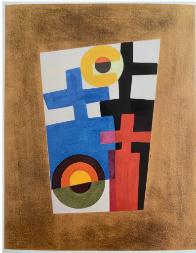
Composition with Cross, Sophie Tauber-Arp, 1928

10:00 AM The Consecration of the Human Being