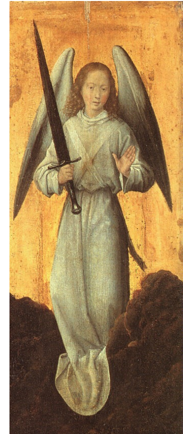
Archangel Michael by Hans Memling