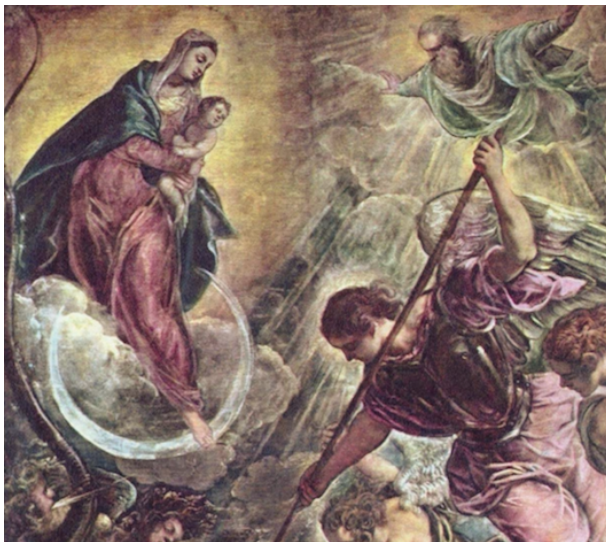
Archangel Michael Fights Satan by Jacopo Tintoretto