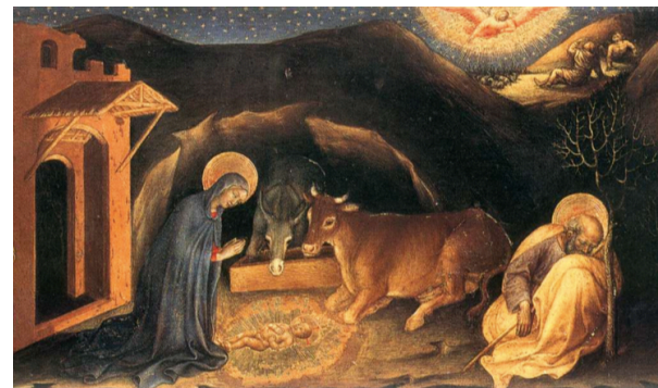
Nativity by Gentile da Fabriano

11:00 AM Help transform the church for Epiphany